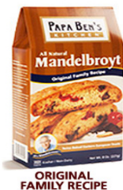
ORIGINAL FAMILY RECIPE