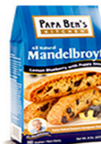
LEMON BLUEBERRY WITH POPPY SEEDS

This twice baked Lemon Blueberry with Poppy Seed Mandelbroyt is a "fusion of tastes" – citrus, sweet blueberry and